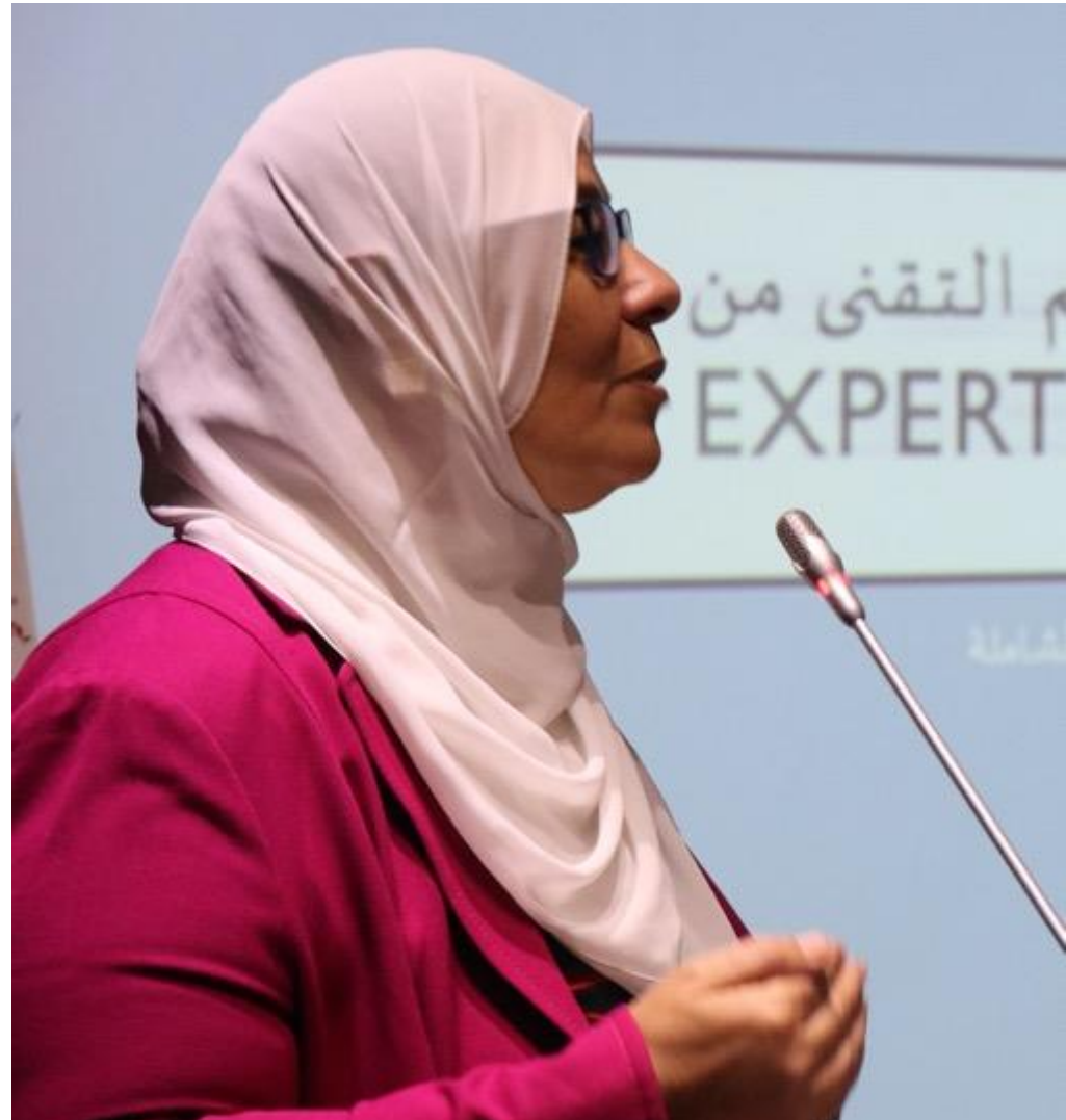
Community Engagement SI Operational Model